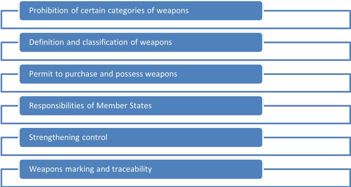
Key Regulatory Points of Directive 2017/853